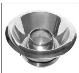
YHC-LD Large diameter