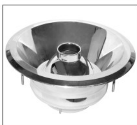
YHC-ABS Plastic chrome plating